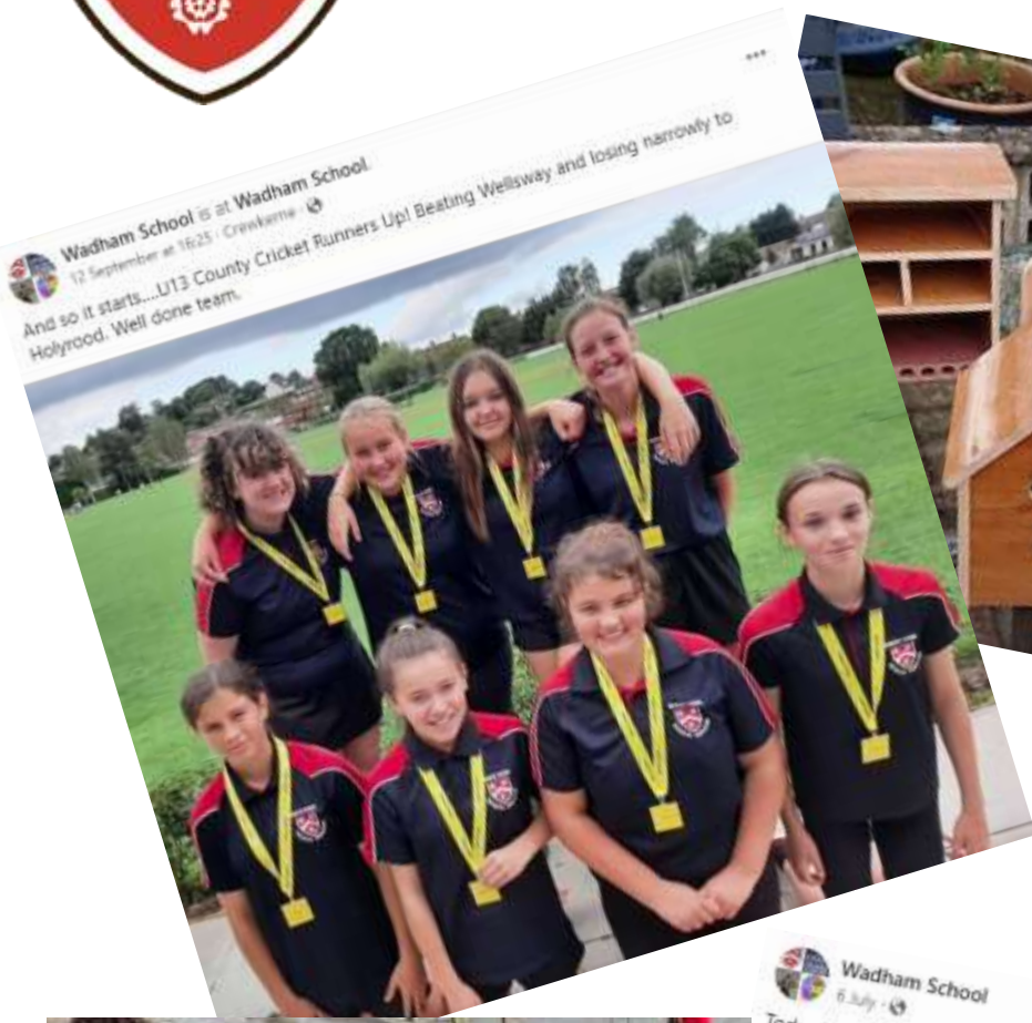
Wadham School is at Wadham School 12 September at 16:25 · Crawkema And so it starts...U13 County Cricket Runners Up! Beating Wellsway and losing narrowly to Holyrood. Well done team.