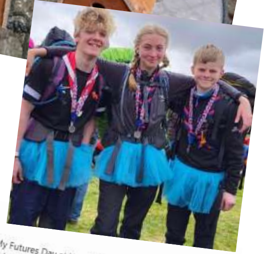
Wadham School 6 July · Today Year 8 have enjoyed a brilliant My Futures Day at Yeovil College. They all experienced a taster session run by the college or local employers. We had students experiencing medicine, crime scenes, sport coaching, construction trades, teaching, care, engineering, media, art and many many more.